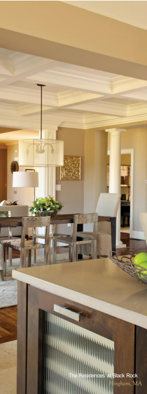
The Residences at Black Rock Hingham, MA