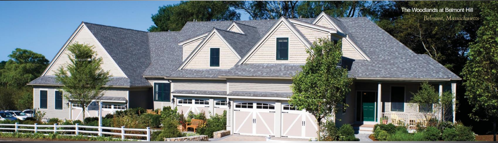
The Woodlands at Belmont Hill Belmont, Massachusetts