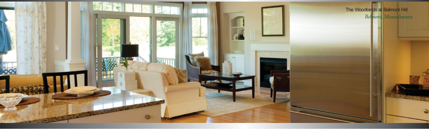
The Woodlands at Belmont Hill Belmont, Massachusetts

Since its inception, Northland Residential has taken great care to integrate its properties into existing landscapes and optimize available resources without compromising quality or sophistication. With the conviction that we can continue to maintain these high standards despite today's economic challenges, all developments in our current portfolio are now being constructed and promoted as "Built Better. Built Northland Residential Green."