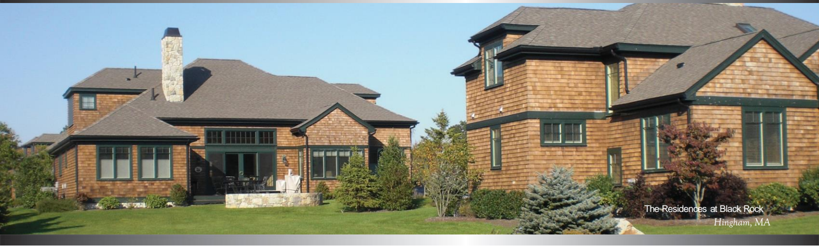
The Residences at Black Rock Hingham, MA